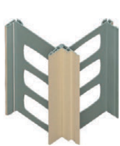
3 pc Corner (inside assembled)

The 3-piece corner makes installing a corner simple. It allows for easy fitment and access to all rebar. The design was created to resolve installer and inspector's worst nightmare.