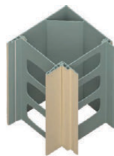
3 pc Corner (assembled)