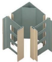
3 pc Corner (apart)